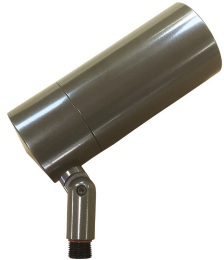
Shown in Bronze Powder Coat Finish (BZ)