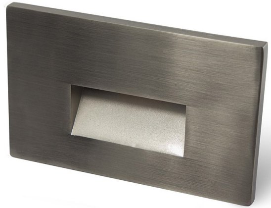
Shown in Brushed Nickel Finish (BN)