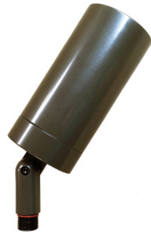
Shown in Bronze Powder Coat Finish (BZ)