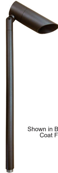
Shown in Bronze Powder Coat Finish (BZ)