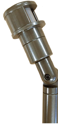
Shown in Bronze Powder Coat Finish (BZ)