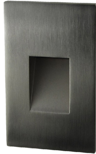
Shown in Brushed Nickel Finish (BN)