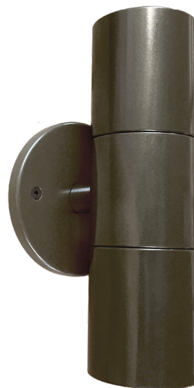
Shown in Bronze Powder Coat Finish (BZ)