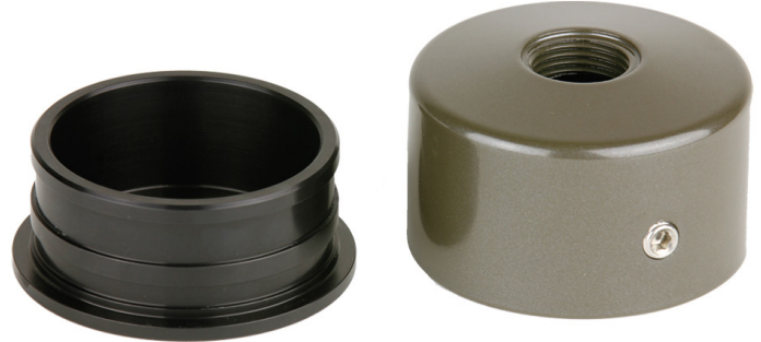
Shown in Bronze Powder Coat Finish (BZ)