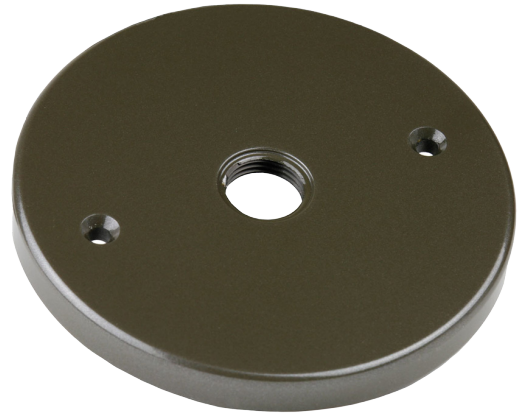
Shown in Bronze Powder Coat Finish (BZ)