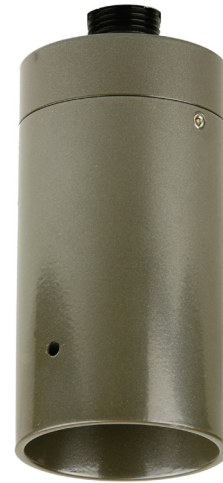
Shown in Bronze Powder Coat Finish (BZ)