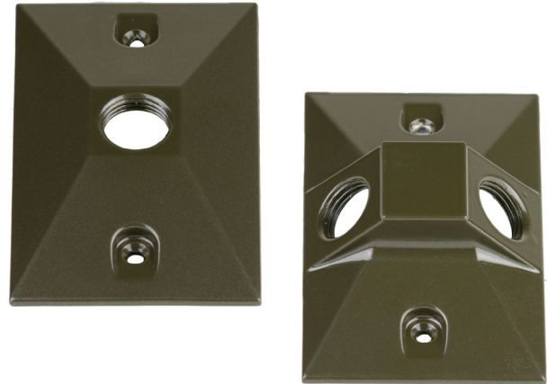
Shown in Bronze Powder Coat Finish (BZ)