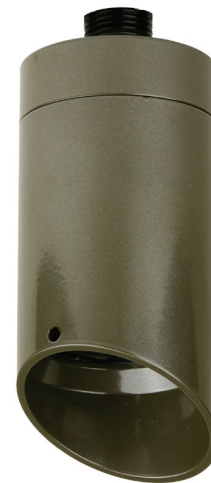
Shown in Bronze Powder Coat Finish (BZ)