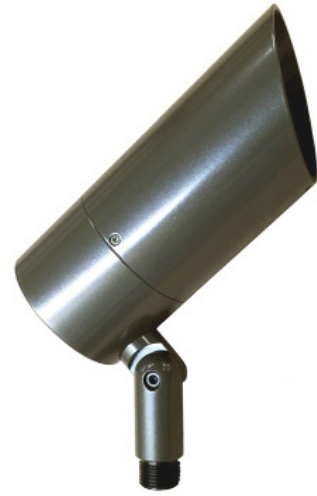
Shown in Bronze Powder Coat Finish (BZ)